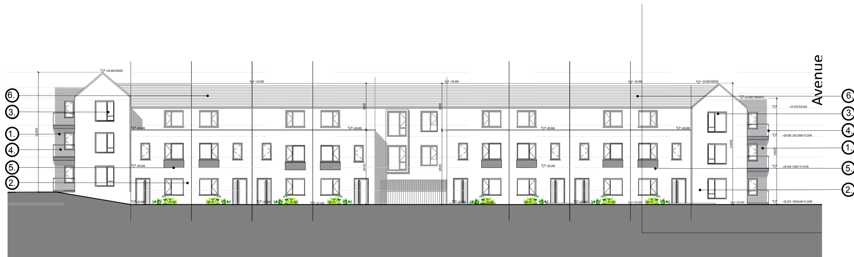
North West Elevation Esc 1:200