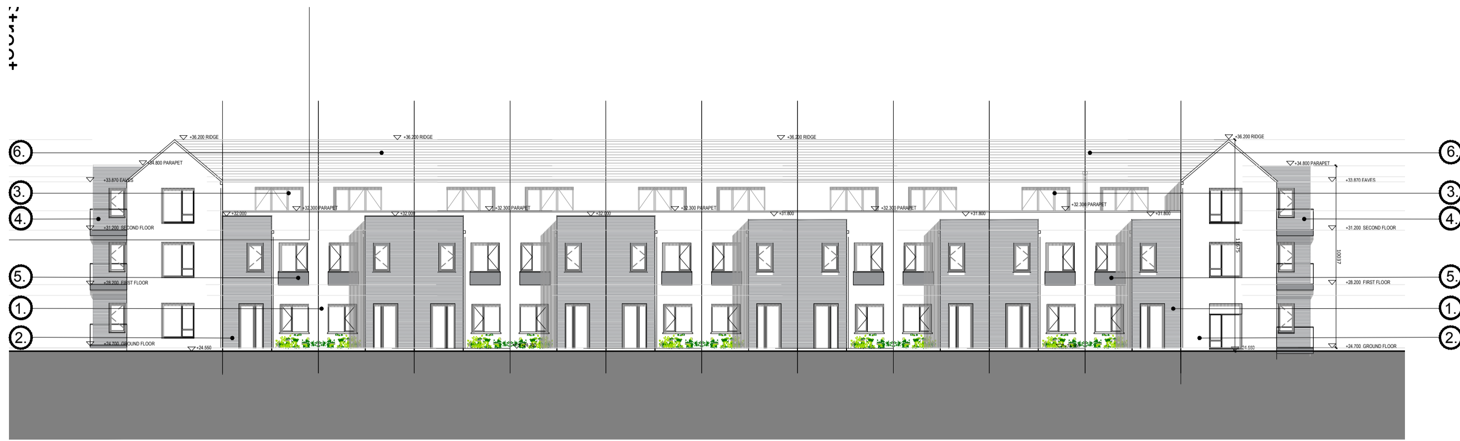
South Elevation Esc 1:200