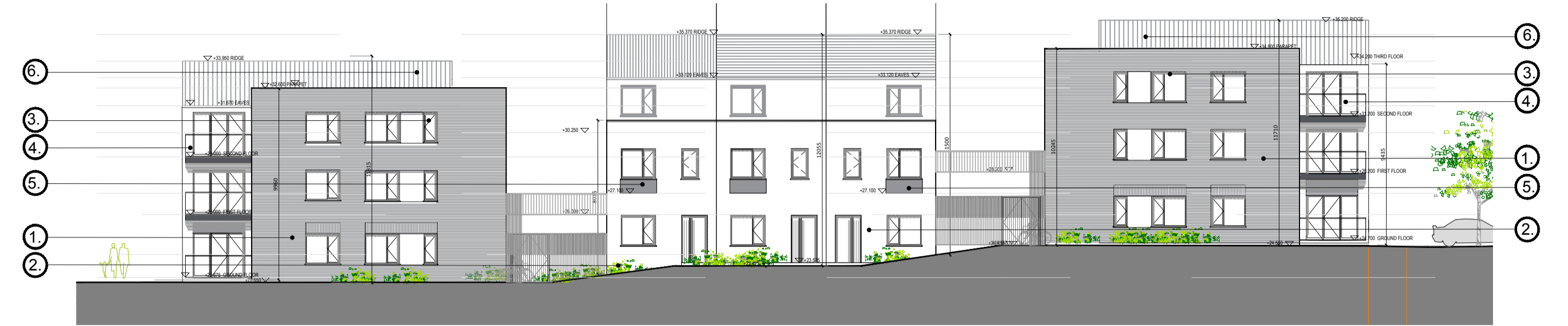
West Elevation Esc 1:200