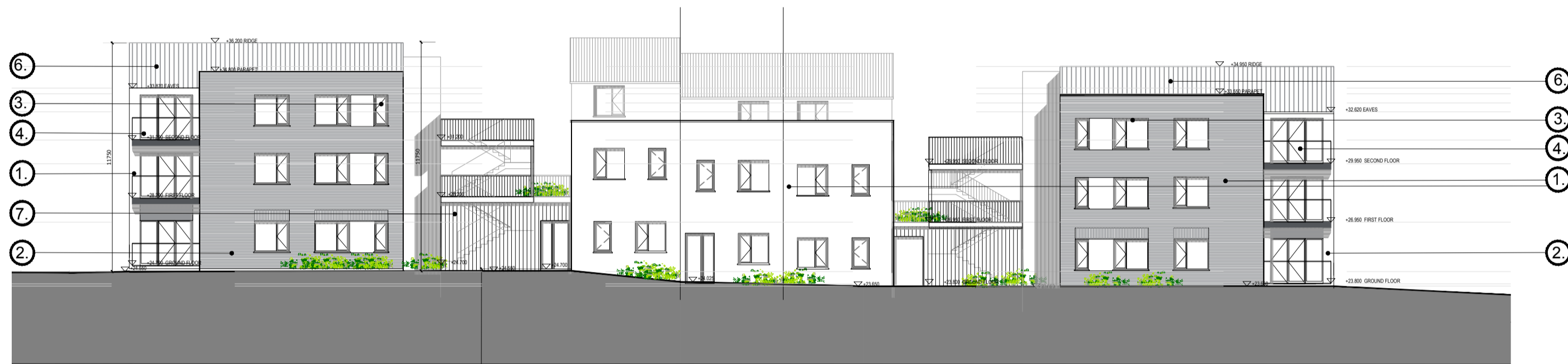
East Elevation Esc 1:200